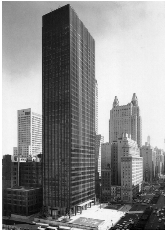
The Seagram Building, New York (1957)

Ludwig Mies Van Der Rohe, along with Le Corbusier and Walter Gropius, is one of the twentieth century's most influential architects. Despite having no architectural training, his influence can be seen in cities the world over, from Anchorage to Adelaide, and the term 'Miesian' is now used to compliment the simplest, most elegant examples of Modernist architecture.