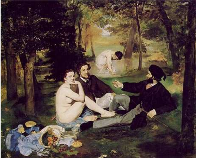
The Luncheon on the Grass, by Édouard Manet (1862-63)

Separately, in the arts and letters, two ideas originating in France would have particular impact. The first was Impressionism, a school of painting that initially focused on work done, not in studios, but outdoors. Impressionist paintings demonstrated that human beings do not see objects, but instead see light itself. The school gathered adherents despite internal divisions among its leading practitioners, and became increasingly influential. Initially rejected by the most important commercial show of the time, the government-sponsored Paris Salon, the Impressionists organised yearly group exhibitions in commercial venues during the 1870s and 1880s, timing them to coincide with the official Salon. A significant event of 1863 was the Salon des Refusés , created by Emperor Napoleon III to display all of the paintings rejected by the Paris Salon. While most were in standard